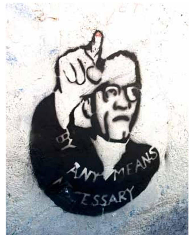
GRAFFITI FROM OAXACA, MEXICO