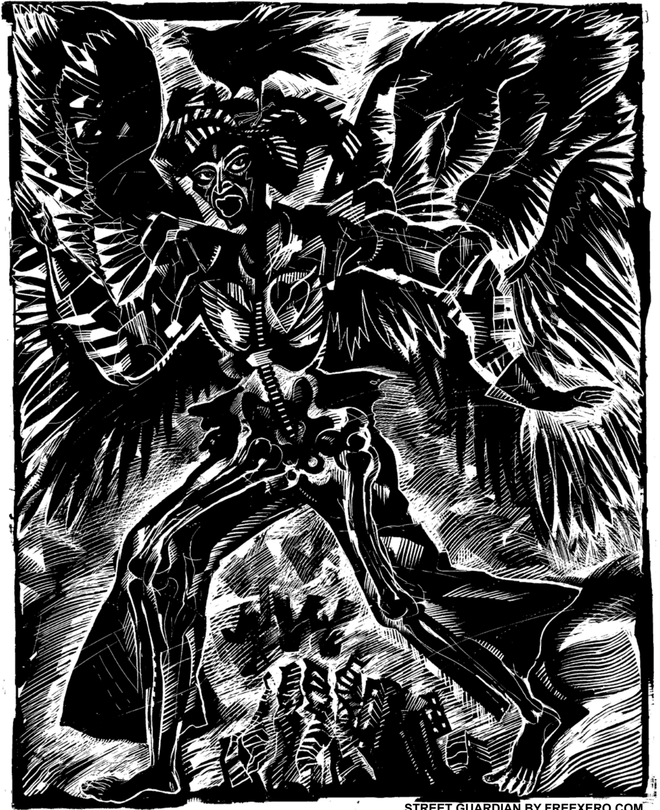
STREET GUARDIAN