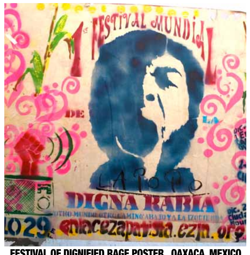
FESTIVAL OF DIGNIFIED RAGE POSTER, OAXACA, MEXICO