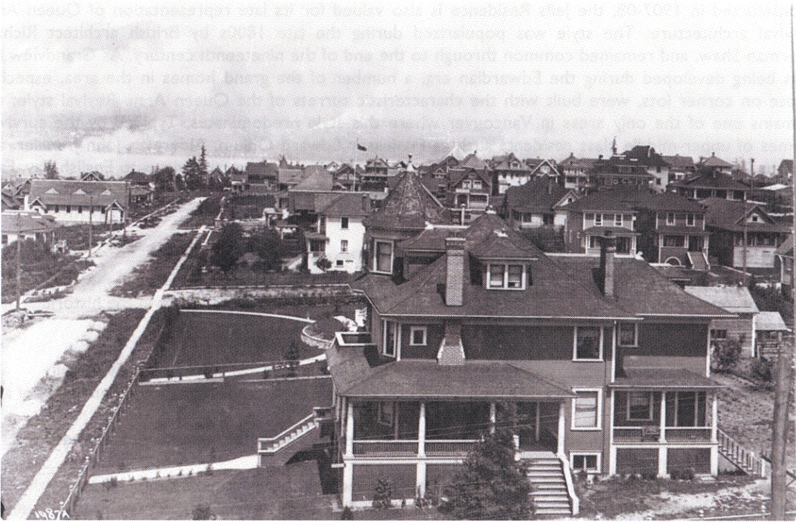
1240 Salsbury Drive, n.d.